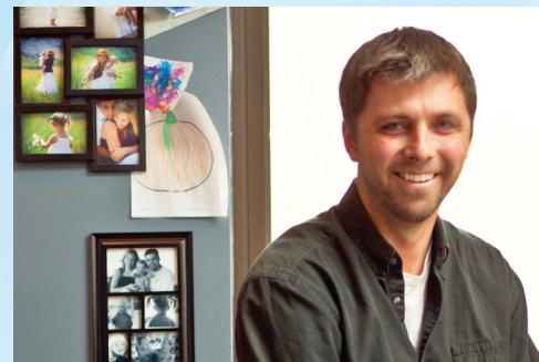
We're in an entrepreneurial revolution.